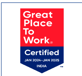
'Great Place to Work' certified