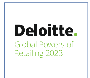
Only Indian retailer in Global Top 100 'Deloitte Global Powers of Retailing' 2023