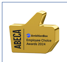
#1 in AmbitionBox Employee Choice Awards (ABECA) 2024 retail mega category