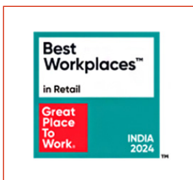
Among 'India's Best Workplaces in Retail' by Great Place to Work